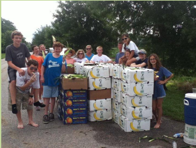
The youth with the 2500 lbs of corn we picked for underprivileged families at our Gleaning Retreat!