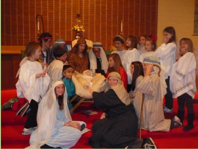
The cast of the Youth and Children's Christmas Play