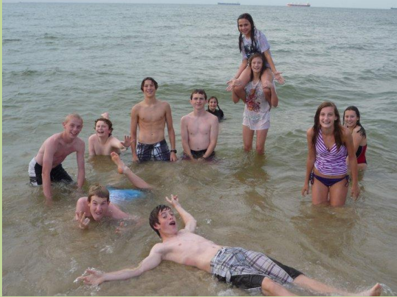
Youth at Chick's Beach for our summer kickoff!